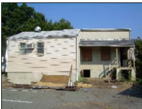
Rear elevation, November 2007

The rear of the east bay has recently been altered by an incomplete construction project. The east half of the rear elevation is recessed from the west rear addition. Two 1/1-sash windows and a rear door pierce the wall. The pre-construction photo on the left indicates the door was fronted by a stoop with side stairs supported by cement block piers. A shed roof was located above the windows about 2' below the roof and was supported by two posts on the stoop.