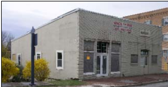
Façade and East Elevation

The two-part, painted brick front, 1 ½ story commercial structure located at 18-20 West Montgomery Avenue is the oldest downtown Rockville commercial structure in its original location. The rectangular plan building has a shed roof that is pierced by a small red brick chimneystack. Built in 1890, the structure predates the 1895 Wire Hardware Store. The 1873 B&O Station, the oldest commercial structure in Rockville, has been relocated.