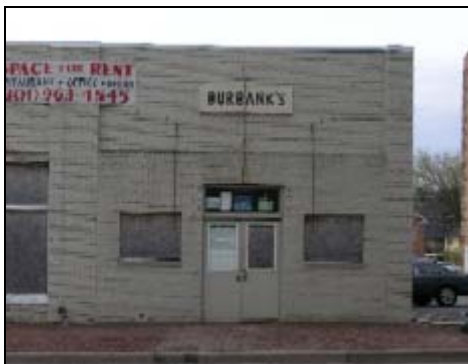
West bay of facade

The West Bay of the façade is characterized by a two-thirds height brick infill that builds out the façade so that it is flush with the piers. Bricks used for this infill wall are more textured than the other façade bricks. An additional brick type was used to patch previous window openings on the west façade bay. The top or cornice line of the infill consists of a brick header row. The only transom is above the door and it is ½ the height of the east bay transoms. The west bay window openings are approximately half the size of the east bay windows. These windows are boarded over, but their slightly projecting brick header sills are evident. The painted metal double doors appear to be recent retail stock items. The brick wall above the infill contains numerous pieces of hardware that likely supported a variety of different signs.