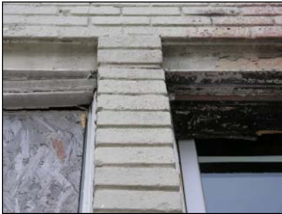
18 West Montgomery Avenue, façade detail

The east bay of the façade is characterized by tripartite fenestration (-w-d-w-) topped by three transoms. The central double door is a recent replacement. The brick piers that separate the windows and door openings are stacked stretcher bricks that do not follow the overall course pattern of the brick façade. These piers may be only facing material. A metal I-beam is the lintel of the openings. The windows have stone sills and the door threshold is stone.