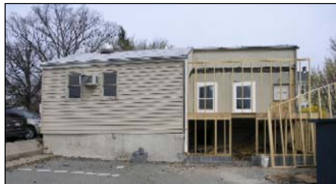
Rear elevation, current