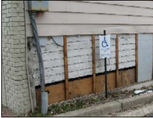
West elevation with German Siding, November 2007